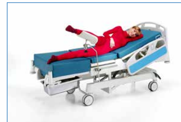
○ Retrosopic examination position