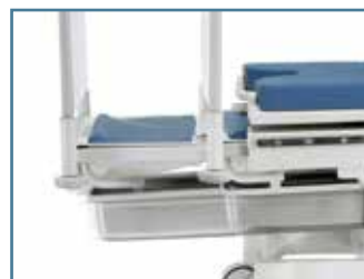
○ Bed extension: integrated mechanical system to extend the bed up to 20 cm.