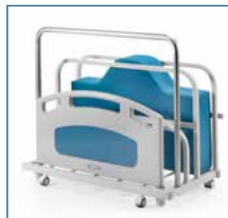
○ Accessories trolley (Optional) Ref. MB-OPTIMA-02