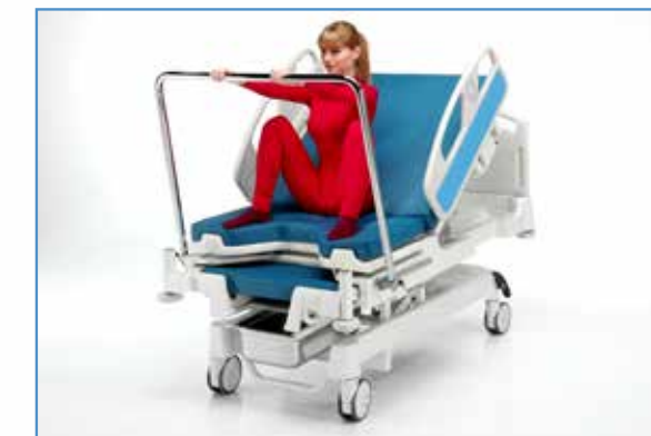
○ Squatting position, with rail