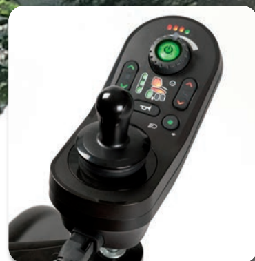
Complete with the new LINX ® controller.