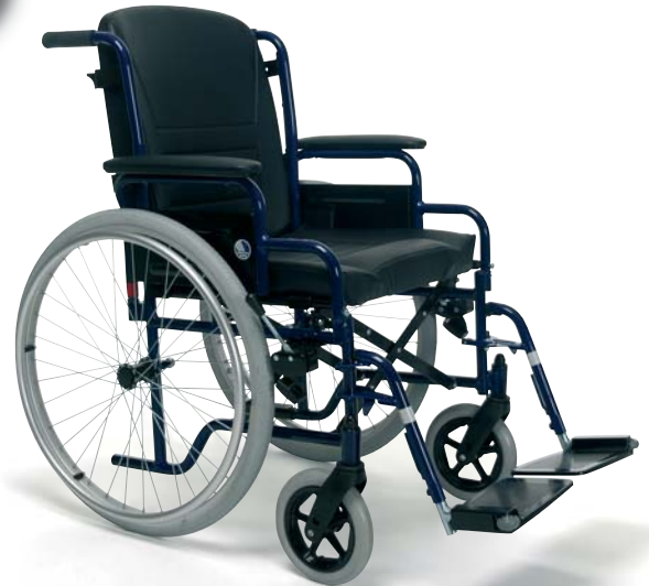
Anatomic version (optional) Max. users weight: 150 kg