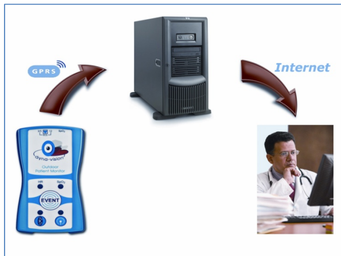
Simple layout of Dyna-Vision™ Monitoring

The server handles all incoming connections and real-time data streams to other locations that want to monitor this data. Other locations can have Dyna-Vision™ Software modules installed to access the data on the server.