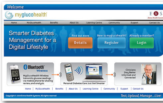
MyGlucoHealth Network Portal